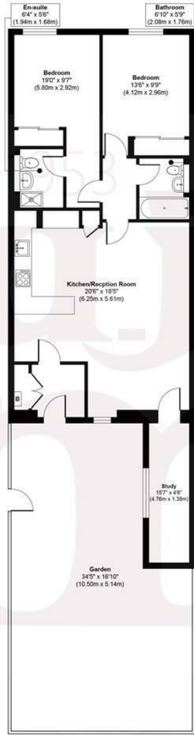
Floor Plan Approximate Floor Area 913 sq. ft (84.88 sq. m)

Approx. Gross Internal Floor Area 913 sq. ft / 84.88 sq. m